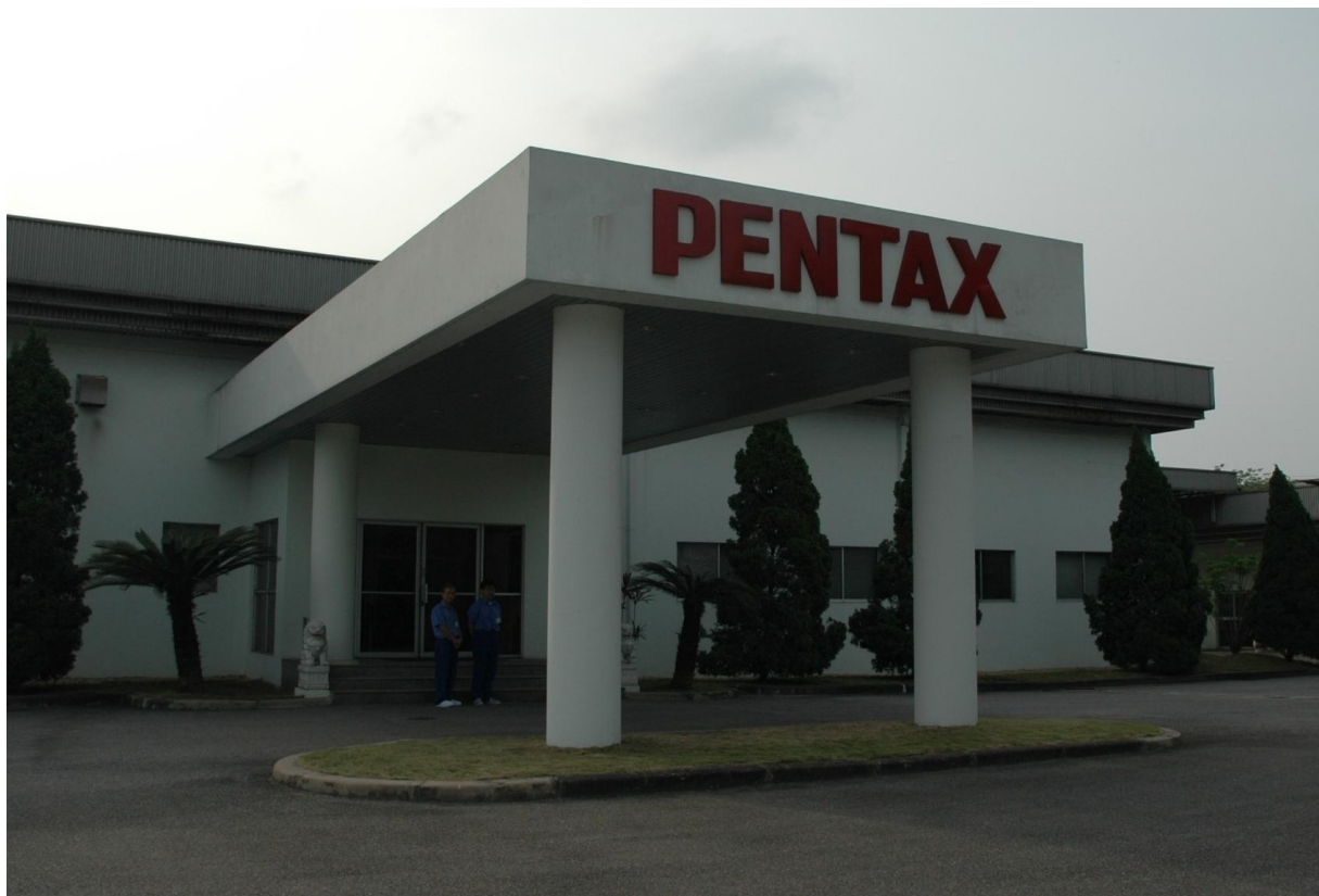
The management of Pentax was very cooperative with the interview and factory visit.

Meanwhile the factories investigated in northern Vietnam were located in industrial zones but differed from each other. Pentax lens factory – Pentax Vietnam – has been based outside Hanoi for sixteen years. Since opening in 1995, Pentax VN has manufactured mainly interchangeable lenses for Pentax brand SLR cameras and CCTV lenses. In recent years, digital compact camera lenses and mobile phone camera lenses have been added to its product lineup, making it a main production base for Pentax lenses. 83 Even though there are migrant workers among the 1,000 employees in the factory, many of them have worked with the factory for several years. The factory is not far from Hanoi city centre, unlike the Samsung factory at Bac Ninh city, 40 km north east of Hanoi.