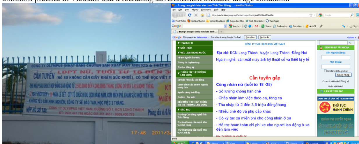
Hiring announcement posted at factory

Olympus' hiring policy targets women aged 18–35. Only hiring those under 35 constitutes age discrimination, even if age discrimination is not legally enforced. Olympus' response to this is that it is a common practice in Vietnam that a recruiting advertisement includes an age condition. 95